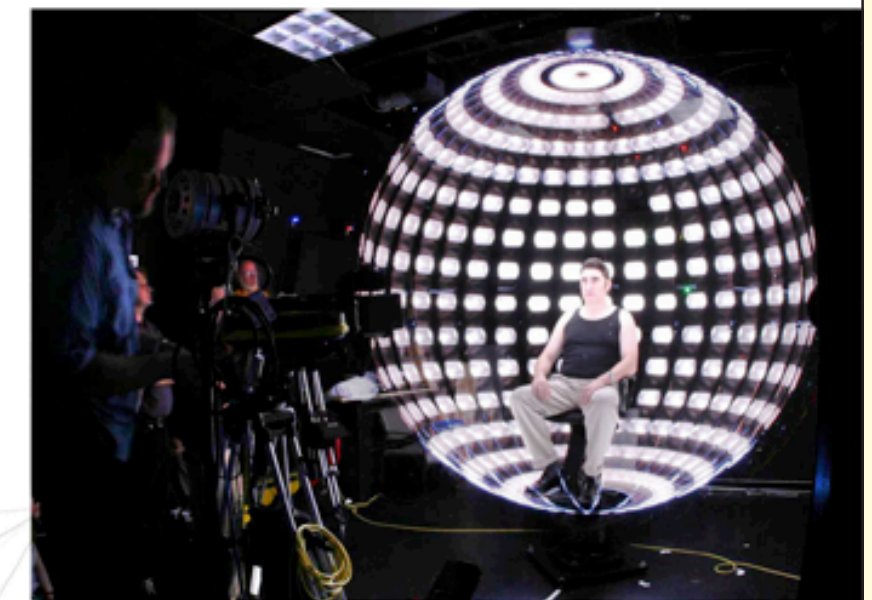
Academy Award Winning "Light Stage" at USC http://gict.usc.edu/lightstage